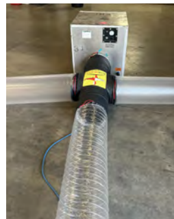
Connex+ on one 12-inch output of a 2000 CFM machine with lay flat & coiled ducting