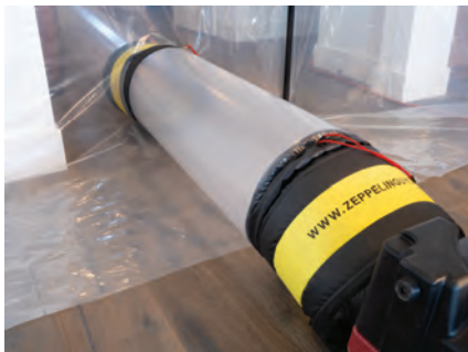
Two Connex setups: one on R500 (12-inch lay flat), one through containment