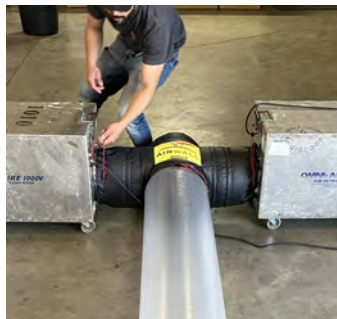
10-inch outputs, two 1,000 CFM machines, one Connex+ and one 12-inch exhaust line