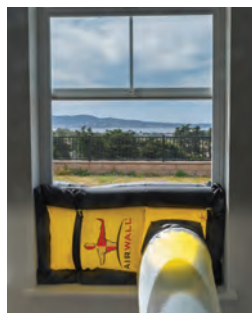
Xhaust 2 with zippers that allow for sizing and for connecting to another Xhaust unit