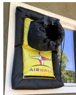
Xhaust 1 works on medium size windows and, like all Xhaust, is tunable for balanced air