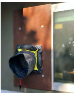
Xhaust Mini in a security board up. Also works on small windows