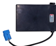
122-3002-14 Battery $588.00