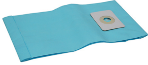
122-3200-14 Disposable Filter Bag for PH 45ASB & 86ASB Master Carton Qty - 100 List Price $3.40 ea.