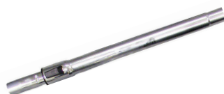
122-3021-14 Telescoping Wand $21.30