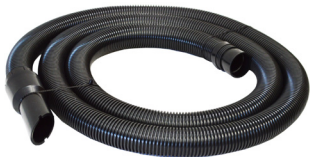
122-3010-14 10' x 1.5" Crushproof Hose w/Ends $48.10