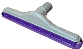
122-3044-14 Floor Tool Multi-Surface 14" x 1 9 / 16 " (40mm) for HEPAPro Vacs Master Carton Qty - 30 List Price $22.70 ea.