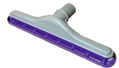
122-3044-14 14" x 1.5" Multi-Surface Floor Tool $22.70