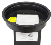
127-3305-14 HEPA Filter $278.00