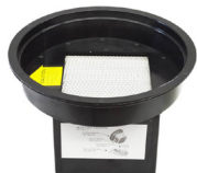
127-3305-14 HEPA Filter $278.00