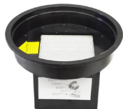
127-3305-14 HEPA Filter $278.00