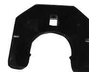
124-7032-14 Locking Clip $6.30

For More Information Visit SterlingNA.com