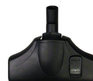
122-3041-14 2-position Ergo Slide Floor Tool $22.00