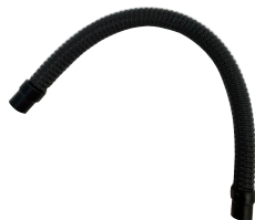
124-7157-14-1 Drain Hose $82.50