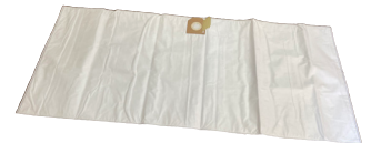
122-3223-14 Disposable Synthetic Filter Bag Master Carton Qty - 20 List Price $10.70 ea.