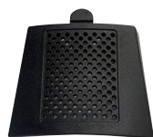
124-7343-14 Exhaust Cover $5.00