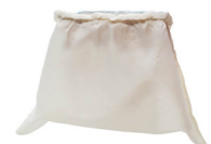
122-3222-14 Dacron Filter Bag $12.90