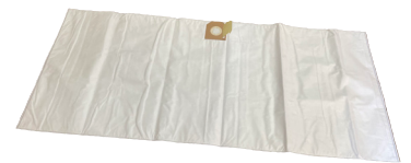
122-3223-14 Disposable Synthetic Filter Bag $10.70