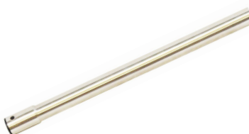
122-3022-14 Extension Tube $8.90