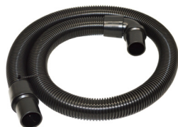
122-3012-14 6' x 1.5" Hose $43.90