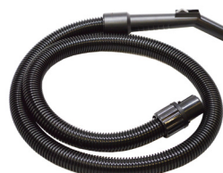
122-3011-14-1 20' x 1.25" Hose $72.70