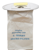
122-3226-14 Disposable Synthetic Bag $3.20