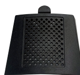
124-7343-14 Exhaust Cover $5.00