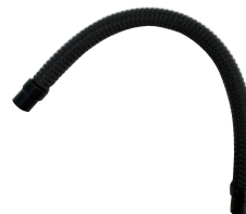
124-7157-14-1 Drain Hose $82.50