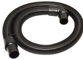
122-3012-14 Hose 6' x 1.5" for HEPAPro Backpacks Master Carton Qty - 10 List Price $43.90 ea.