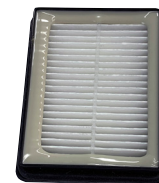
124-7344-14 HEPA Filter Exhaust $17.10