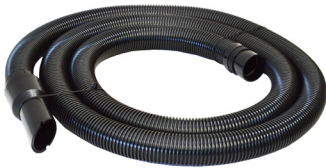
122-3010-14 10' x 1.5" Crushproof Hose w/Ends $48.10