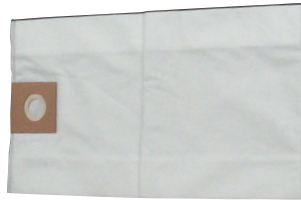
122-3224-14 Disposable Filter Bag Synthetic for HEPAPro 10 & 20 Master Carton Qty - 120 List Price $6.00 ea.