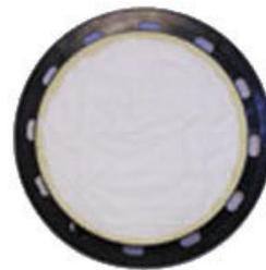
127-3300-14 HEPA Filter for HEPAPro 4 & PH 390ASB Master Carton Qty - 20 List Price $180.00 ea.