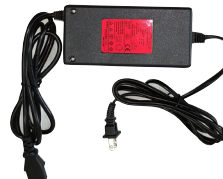
122-3003-14 Charger $132.00