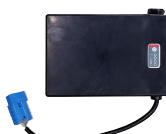
122-3002-14 Battery $588.00