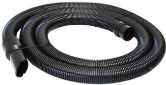
122-3010-14 10' x 1.5" Crushproof Hose w/Ends $48.10