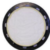
127-3300-14 HEPA Filter $180.00