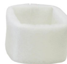
128-7503-14 Spacer Sleeve $18.70