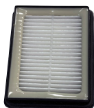
124-7344-14 HEPA Filter Exhaust $17.10

For More Information Visit SterlingNA.com