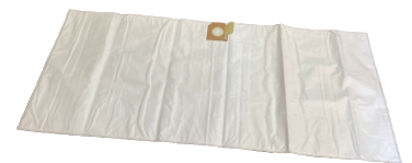
122-3223-14 Disposable Synthetic Filter Bag $10.70