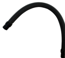
124-7157-14-1 Drain Hose $82.50