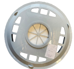
127-3302-14 HEPA Filter for GD-930 Master Carton Qty - 20 List Price $180.00 ea.