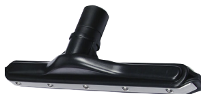
122-3050-14-1 Floor Tool Squeegee 14" x 1.5" For Wet/Dry Vacs Master Carton Qty - 30 List Price $23.50 ea.