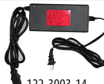
122-3003-14 Charger $132.00