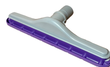
122-3044-14 14" x 1.5" Multi-Surface Floor Tool $22.70