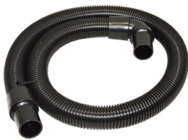
122-3012-14 6' x 1.5" Hose $43.90