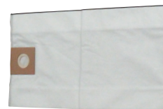
122-3224-14 Disposable Synthetic Filter Bag $6.00