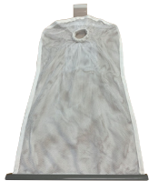
124-7159-14 Mesh Filter Bag w/Lid $38.20