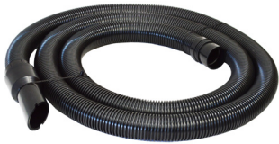
122-3010-14 Crushproof Hose 10' x 1.5" Dia $48.10