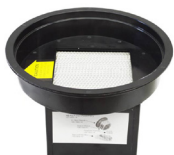
127-3305-14 HEPA Filter $278.00