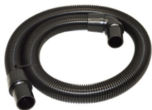
122-3012-14 6' x 1.5" Hose $43.90