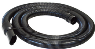
122-3010-14 10' x 1.5" Crushproof Hose w/Ends $48.10