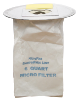
122-3226-14 Disposable Filter Bag Closed Collar for HEPAPro 6 Backpack Master Carton Qty - 200 List Price $3.20 ea.