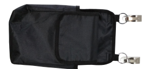
122-3004-14 Battery Holster $20.00

For More Information Visit SterlingNA.com