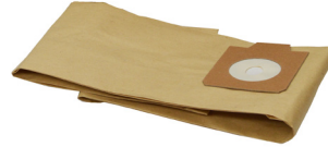
122-3202-14 Disposable Filter Bag Paper for HEPAPro 4 Master Carton Qty - 200 List $3.20 ea.