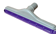
122-3044-14 14" x 1.5" Multi-Surface Floor Tool $22.70