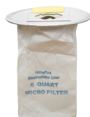
122-3226-14 Disposable Synthetic Bag $3.20