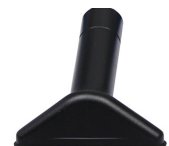
122-3070-14 Upholstery Tool 5" x 1.5" for HEPAPro Backpacks Master Carton Qty - 60 List Price $5.10 ea.