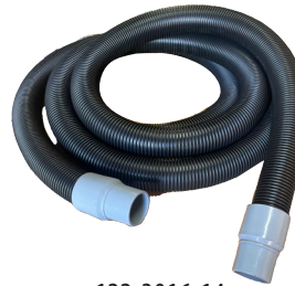
122-3016-14 Hose 2" x 20' for HEPAPro Backpacks Master Carton Qty - 7 List Price $69.40 ea.