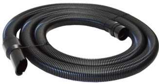
122-3010-14 Hose 10' x 1.5" Friction Fit w/Straight & Angled Cuffs for HEPAPro Vacs Master Carton Qty - 7 List Price $48.10 ea.