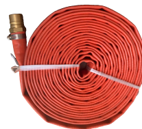
124-7158-14 Pump Out Hose $273.00

For More Information Visit SterlingNA.com