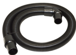
122-3012-14 6' x 1.5" Hose $43.90