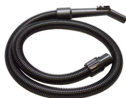
122-3011-14 6' x 1.25" Hose $24.90