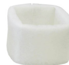
128-7503-14 Spacer Sleeve $18.70